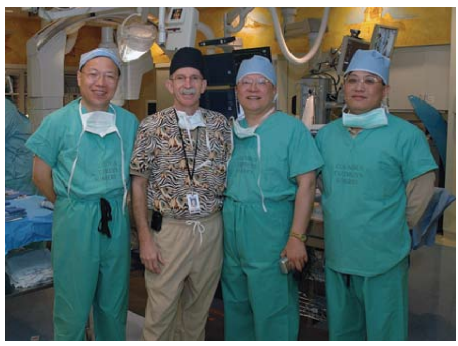
The Columbus Children's Hospital China Program officially began in 2005 with written affiliations in three hospitals: Cardiovascular Institute and Fuwai Hospital, Beijing, Shanghai Children's Medical Center - Pudong District, Shanghai and Wuhan Children's Hospital.

The Columbus Children's Hospital China Program officially began in 2005 with written affiliations in three hospitals: Cardiovascular Institute and Fuwai Hospital, Beijing, Shanghai Children's Medical Center - Pudong District, Shanghai and Wuhan Children's Hospital. To date, more than 20 physicians teach and learn in the following areas of The Heart Center: